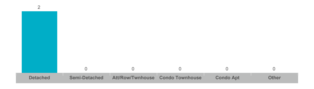
Sales-to-New Listings Ratio