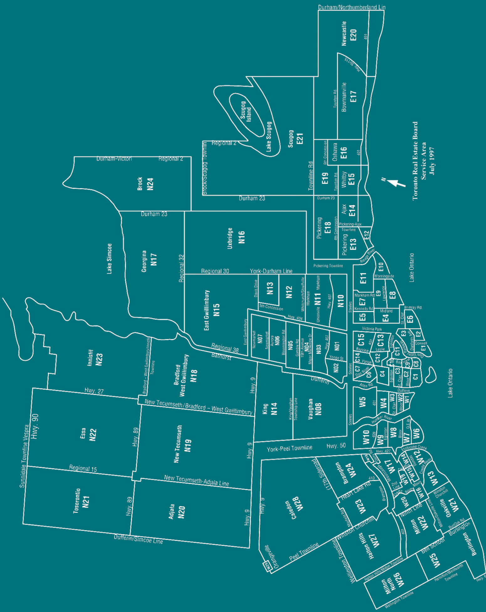
Toronto Real Estate Board Service Area July 1997